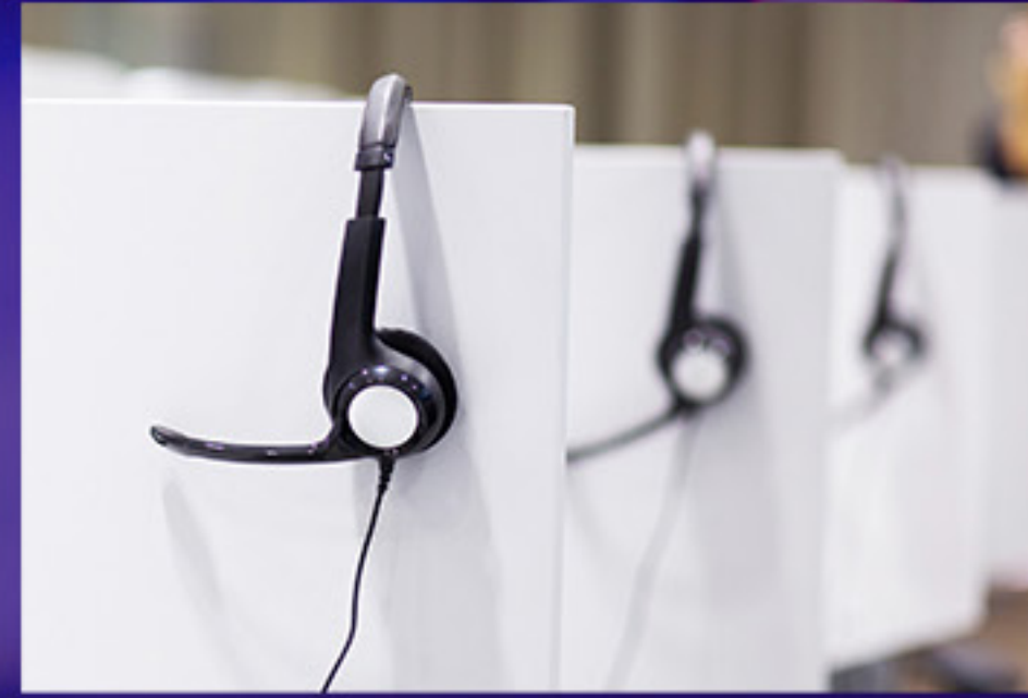
Use external microphone